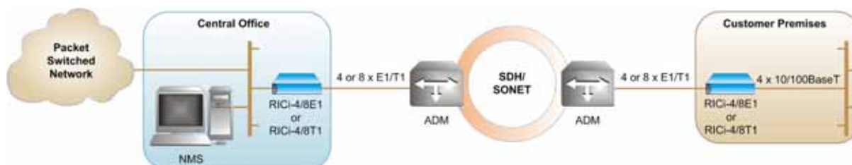
Figure 2. RICI-4E1/T1, RICI-8E1/T1 Extends Ethernet Services over Multiple E1/T1 Circuits